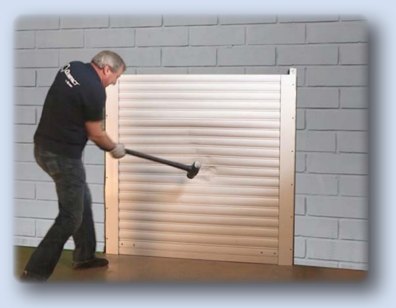
In impact testing, Qompact withstood 82 punches, 5 kicks, and 80 hits with a sledge hammer. The foam-filled shutter was destroyed in seconds.

In head-to-head tests, Qompact outperformed its foam-filled competitors every single time.