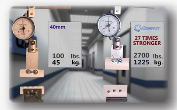
Pull-Apart Strength Test with 152mm (6in.) Sample. Oompact Pull Apart at 8050 kg/m 40mm Pull Apart at 296 kg/m

The improved slat design is 27-times stronger than a perforated 40mm slip hinge, making a Qompact shutter impenetrable by comparison.