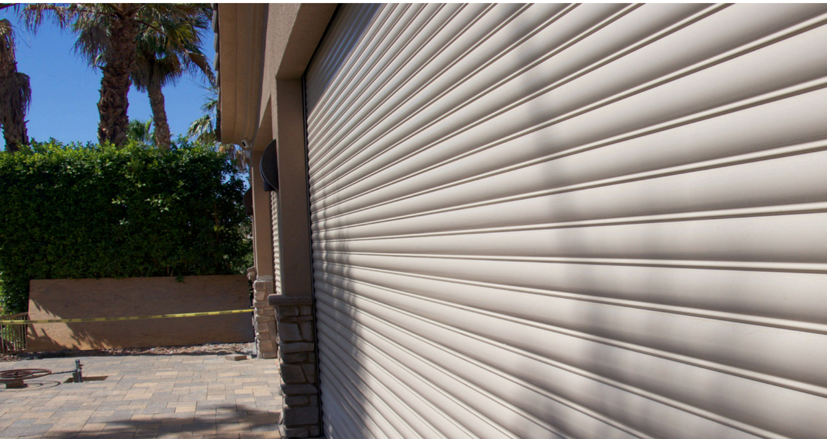
Qomcompact shutters protecting wide home openings from threats.

*Based On Pull-Apart Load and Sledge Hammer Testing.