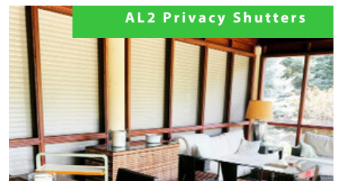
AL2 Privacy Shutters