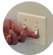
Wall Switch (Motor)