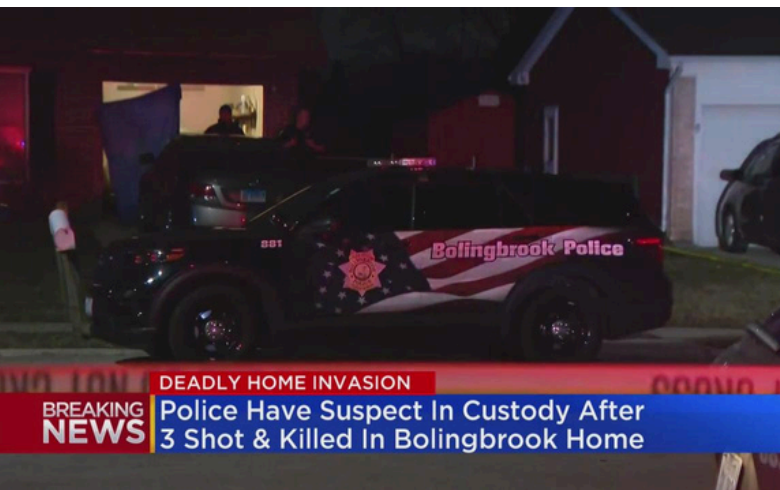
Home invasions and violent crime risk on the rise in many communities.

—(FBI, Google Consumer Surveys [The Zebra], 2024)