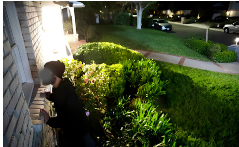
Security shutters signal to criminals that a home is protected, often causing them to move on to softer targets.