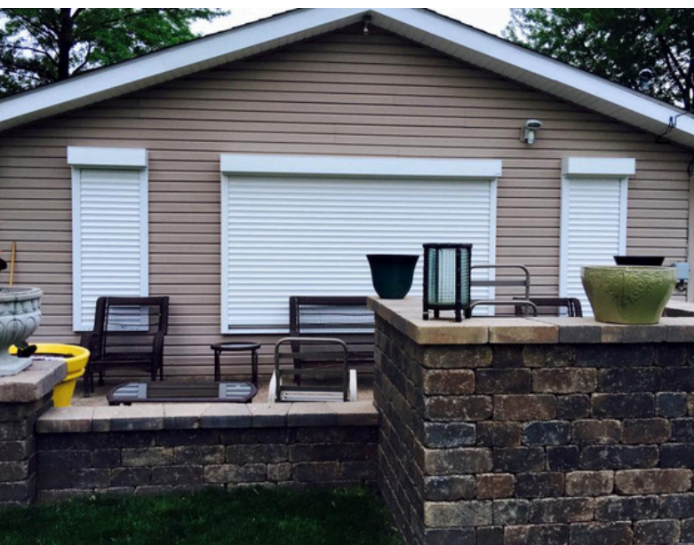
Exterior mounted Qcompact shutters were installed over various openings to bolster the security of the home's rear.

The shutters also seamlessly integrated with the home's exterior, enhancing its overall appearance and curb appeal. It was a win-win for the homeowner who was very pleased with the aesthetics of the shutters.