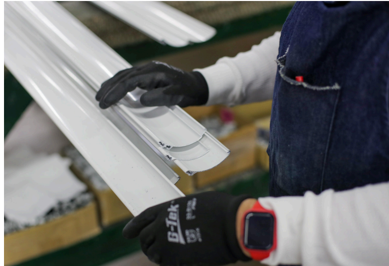
Thick slats contribute to Qomcompact's unmatched strength, to thwart active threats.

*Based On Pull-Apart Load and Sledge Hammer Testing.