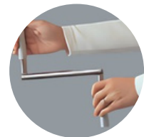
Crank Pole (Manual)