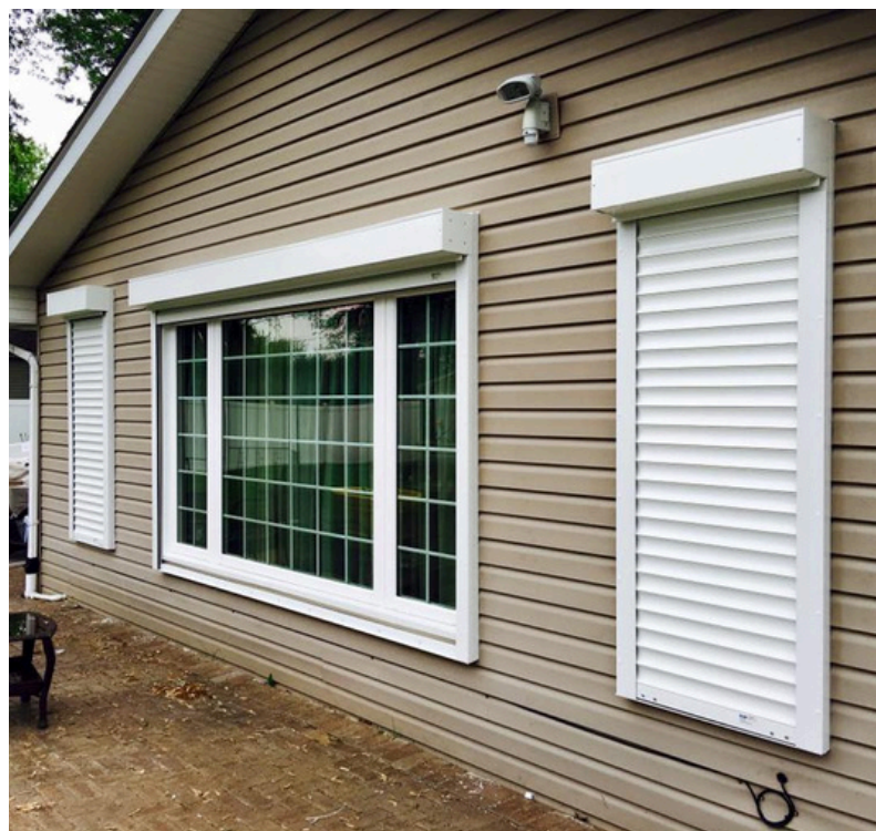
The motorized Qcompact shutters allowed the convenience of remote operation from anywhere inside or outside the home.