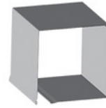
90° angle (square)

Constructed from aluminum alloy in 6, 6.5, 7, and 8 in. sizes.