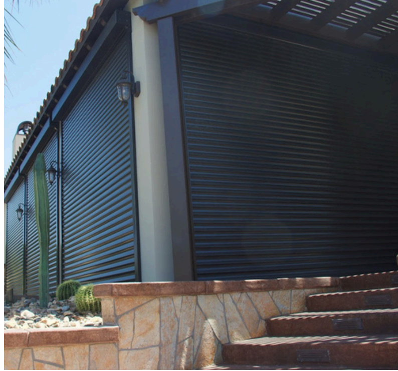
A strong defense against crime, Qcompact security shutters are designed to withstand even the most determined forced entry attempts.

Beyond security, Qcompact shutters enhance your home's curb appeal. Available in various styles and finishes, with a discreet box housing, they seamlessly integrate with any exterior design. Enjoy both heightened security and a stylish home with QMi Qcompact security shutters.