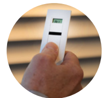
Wireless Remote (HZ) (Motor)