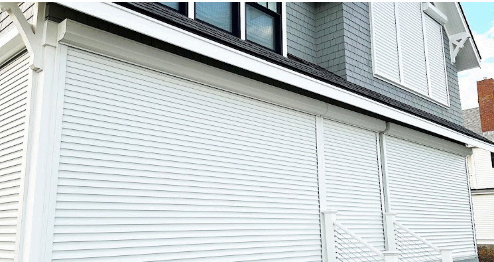
Qcompact shutters are designed to blend seamlessly into your daily life, providing superior security without sacrificing convenience.