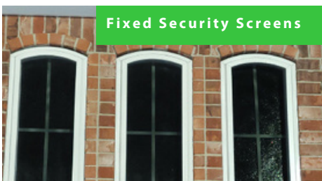
Fixed Security Screens