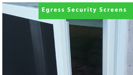
Egress Security Screens