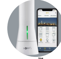
TaHoma™ (HZ) (Motor)

QMi partners with industry-leading motor manufacturers like Somfy® and OZ Roll® to offer the highest quality drive, software, and control systems.