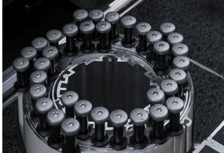
The elegant and tightly nested Qcompact roll sets the standard for superior security with a charming appeal.