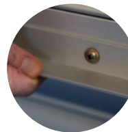
Spring Assist (Manual)

Remote operation provides flexibility across your home.