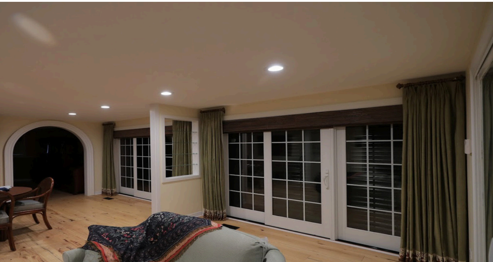
Even from the interior, Qcompact shutters can compliment a home's appeal.