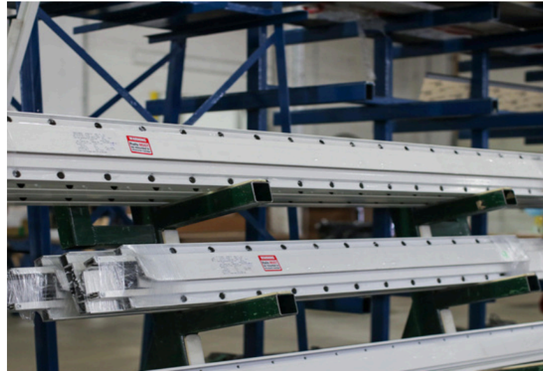
Rail holes pre-drilled for an effortless installation.