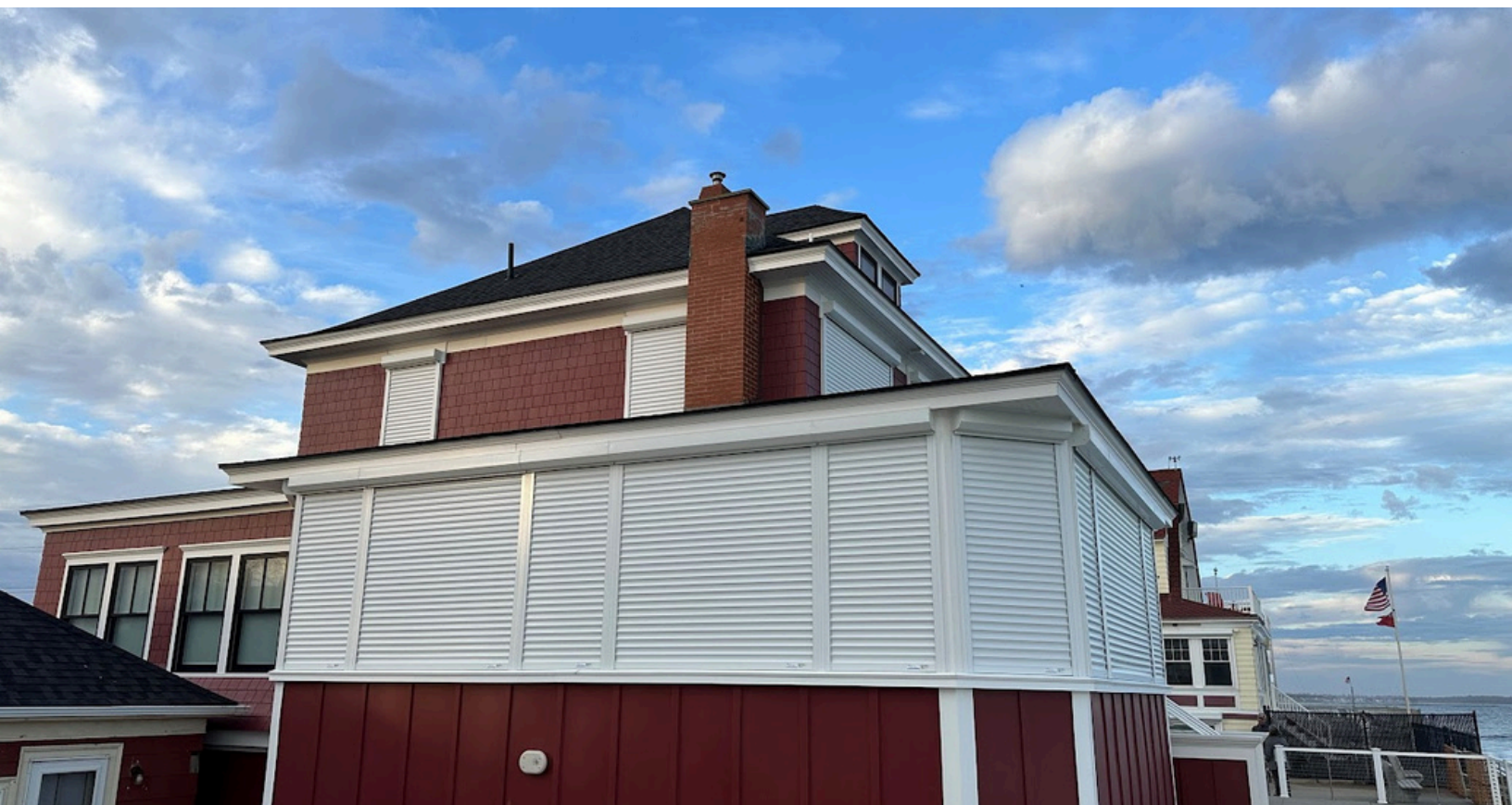
Qcompact hurricane shutters offer a tailored fit, designed to match your home's unique style while providing maximum security.