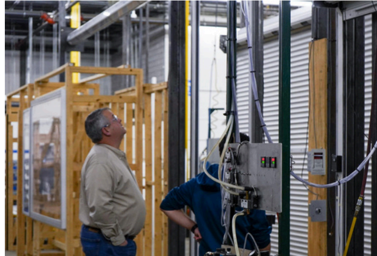
QMi tests for hurricane performance and overall cycle durability.