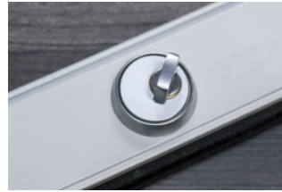
Base Slat Thumbturn