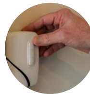
Battery (EZ) (Motor)