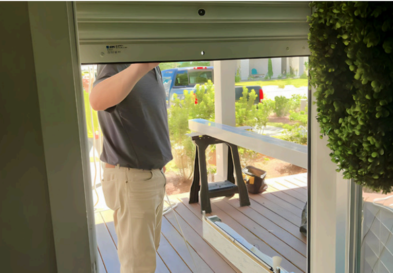
The instinctive finger pull paired with a mid-curtain lock makes operating and locking manual Qcompact shutters absolutely effortless.