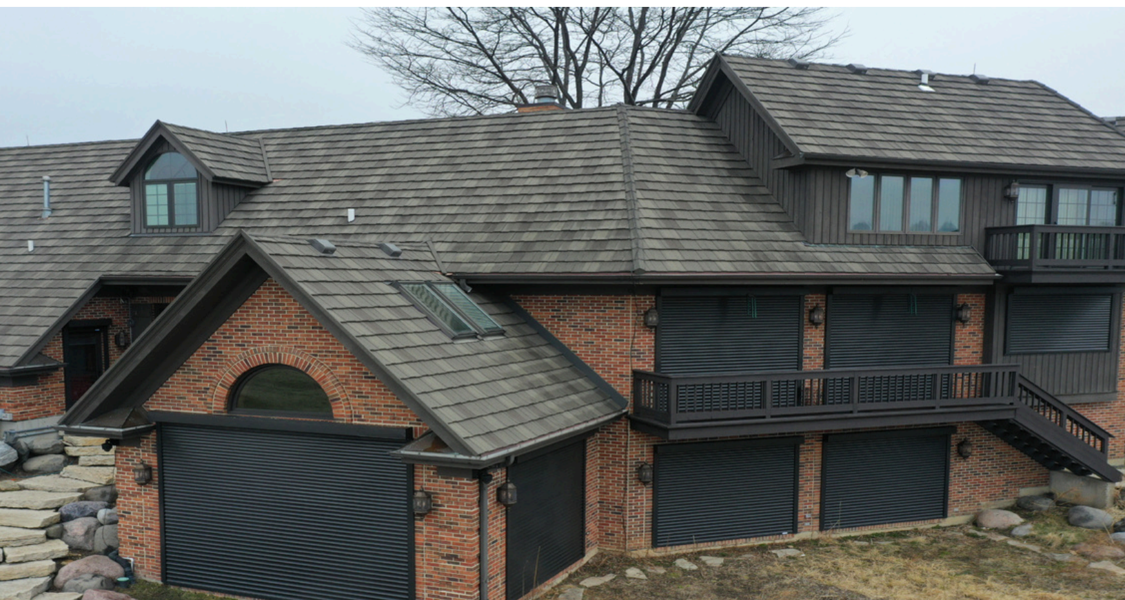
Compact shutters protecting a home's critical access points.