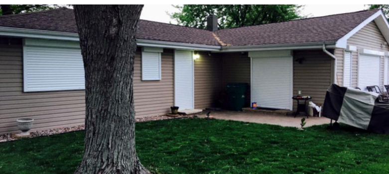
Qcompact had this homeowner covered, and it was clear to would-be intruders that this home was protected.

"I'm so grateful that I installed Qcompact shutters. They've made me feel much safer in my home, and I've recommended them to several neighbors looking to enhance their home's security."