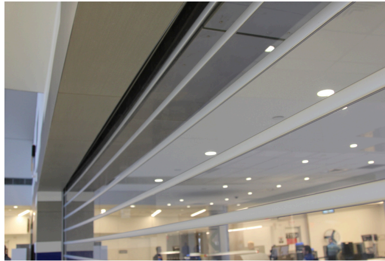
TR4's polycarbonate panels provide clear views along their entire length.