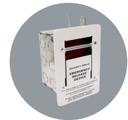
Emergency Release Handle