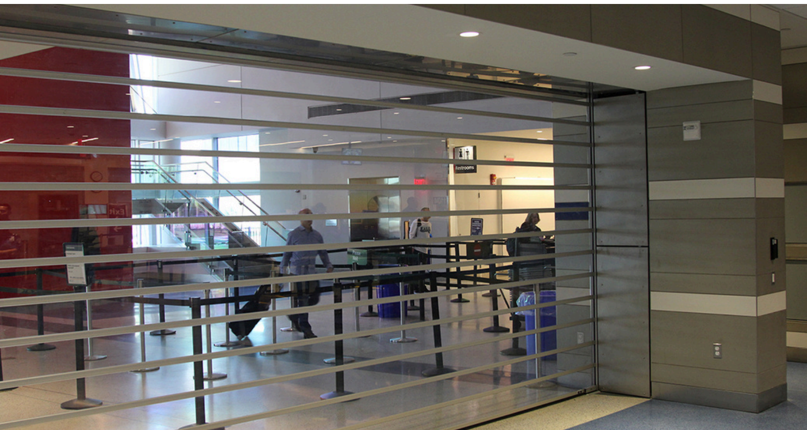
Passenger area at major U.S. International airport.