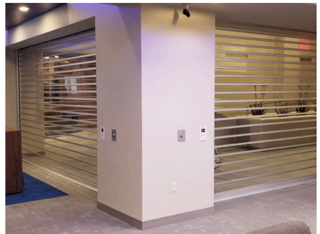
Corner installation ensures panoramic views with easy-to-reach Egress handles.