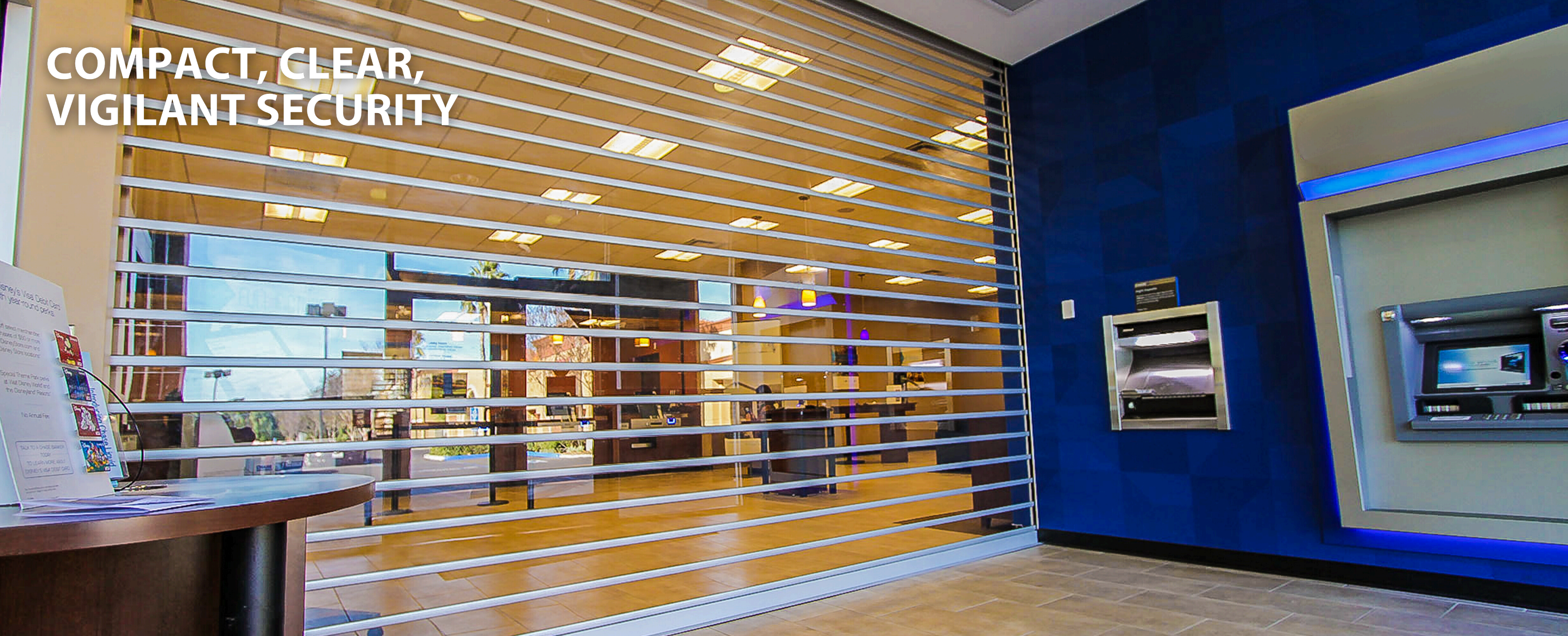
Elegant, transparent vestibule protection.