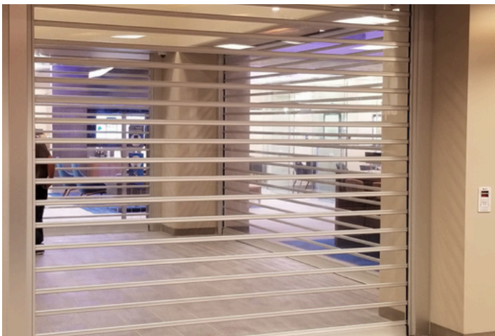
Unobstructed views in a bank lobby from any angle.

By selecting TR4 Transparoll shutters, the bank chain was able to achieve its goal of providing a highly secure and aesthetically pleasing environment for its customers. The highly-efficient slat wrap design of TR4 delivered the installation flexibility the architects needed to scale the solution broadly across sites.