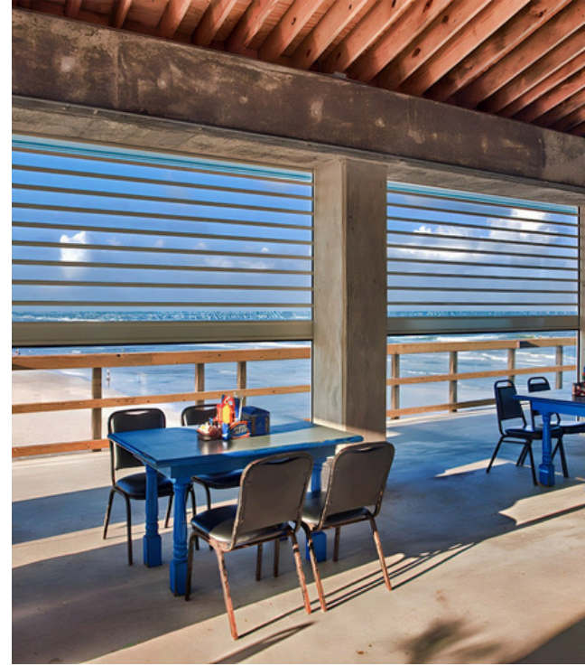
TR4 protecting an outdoor restaurant with panoramic views.

As the demand for clear, high-visibility shutter solutions continues to grow, QMi continues to enhance its product line to offer even greater levels of security, aesthetics, and energy efficiency. Incorporate TR4 shutters as an essential component of your modern commercial property design to reliably and attractively protect key building openings.