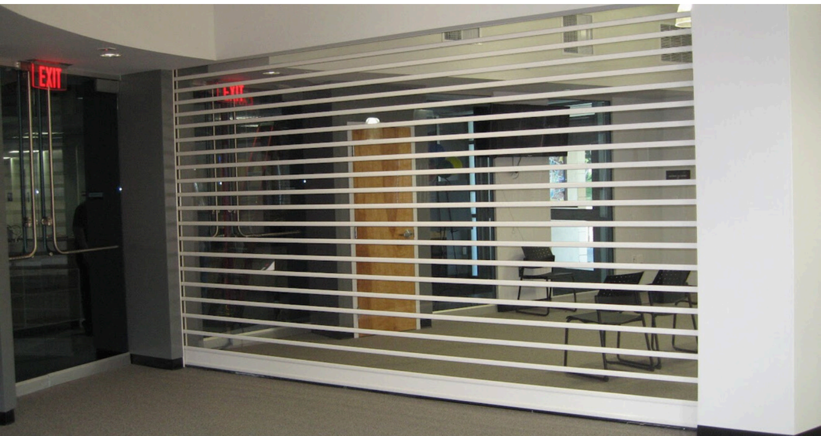
TR4 Transparoll® protects indoor and heavy traffic areas.