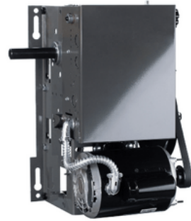
Jackshaft Motor (Ref)