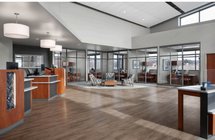
Open concept lobby areas require high-visibility security.

—Future Workplace Poll, Harvard Business Review, 2018