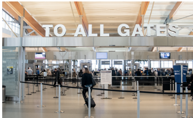
Airports and other high-traffic security areas demand clarity for passengers and security personnel.