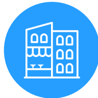
Bars and Restaurants