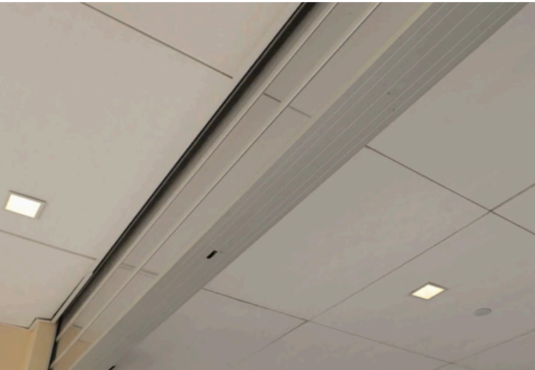
Base slat bottom plate can be tailored to hide ceiling opening when shutter is up.