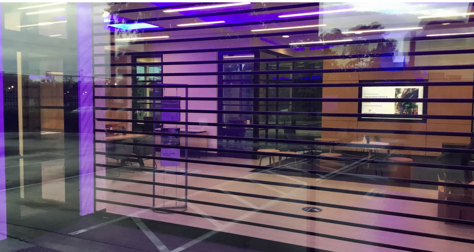
Black anodized TR4 provides striking security complement to this lobby area.