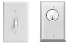
Wall or Key Switch