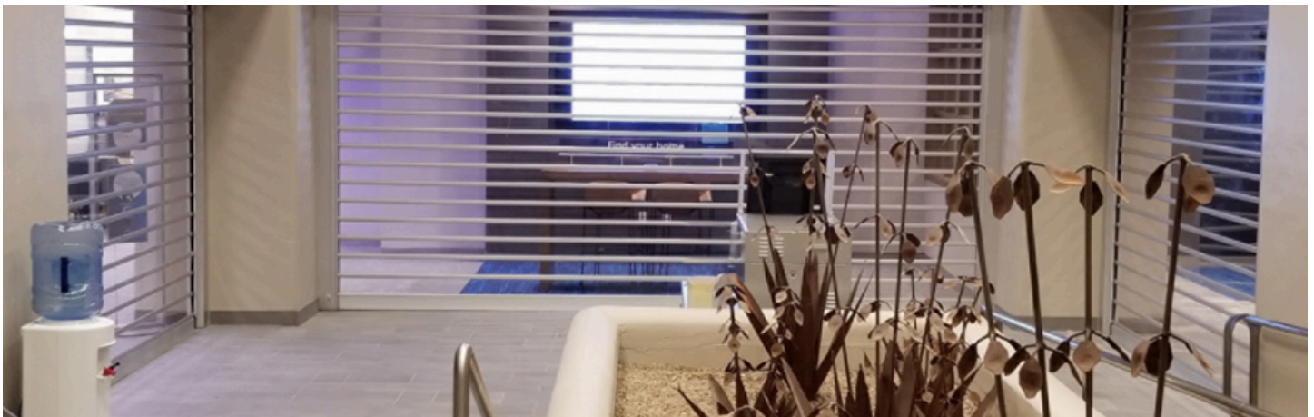
Multi-sided lobby installation maximizes sense of openness.